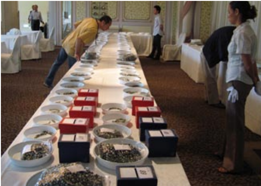
The Fiji Pearls Auction was well attended, drew buyers from all over the world, and resulted in sales of some 80% of all the goods offered.